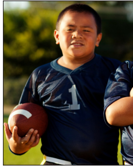
Flag Football FALL